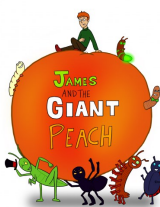
Gracie Panniers 4F